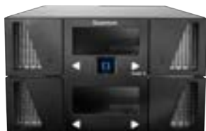
Scalar i6 control module.