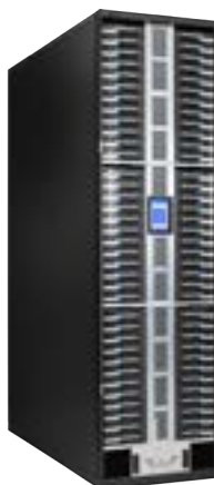
Scalar i7 RAPTOR.