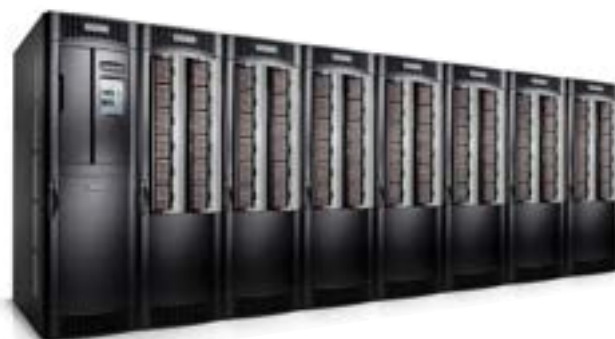
Scalar i6000 features ultra-high density and a 19-inch rack form factor, and scales from 100 to 14,100 cartridges.